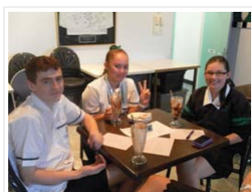
Year 11 Students enjoying the coffee shop experience