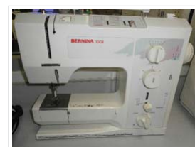
1 x BERNINA MODEL 1008 Sewing Machine