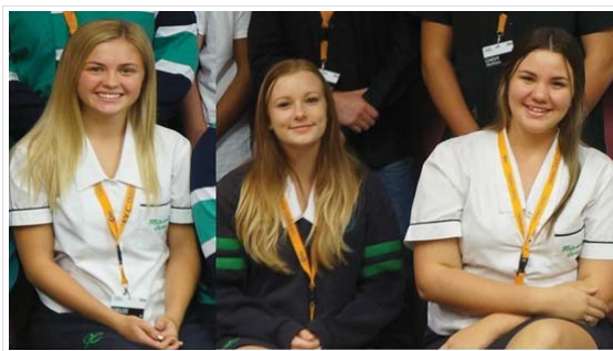
Classic Holidays Trainees

We sincerely thank Classic Holidays for their ongoing support of our school and our students.