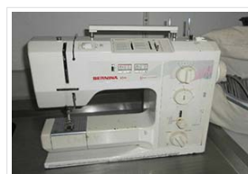
5 x BERNINA Model 1011 Sewing Machines