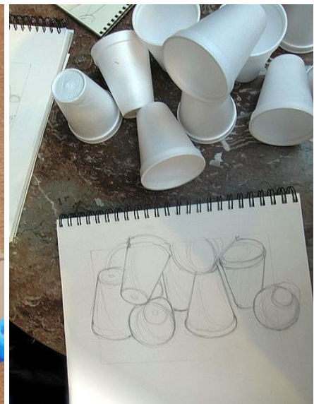
Look at what you are drawing! Do not use from your memory.