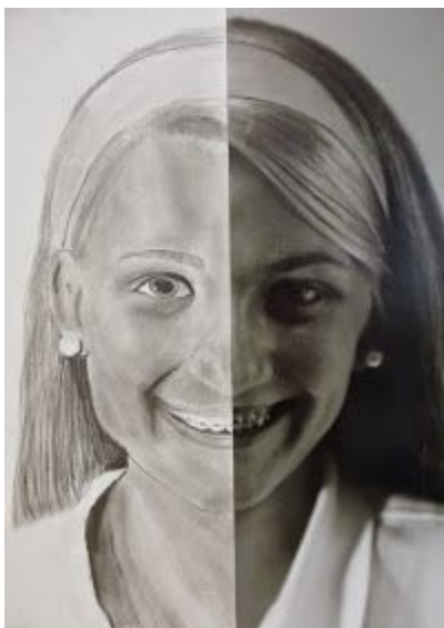
Take a photo and cut it in half. Finish the other half