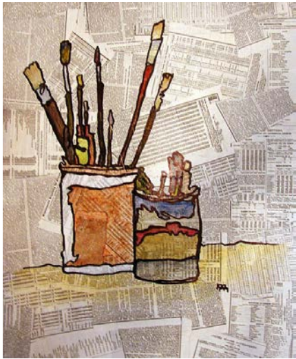
Consider what the background is and what materials you are using.