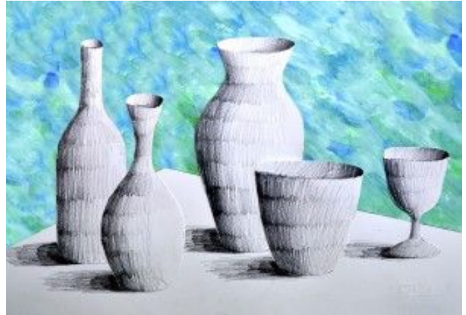
Look for the lightness and darkness within your still life and identify where it is.