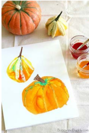
Have the object next to you when drawing. Create a stylised drawing