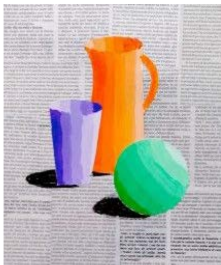
Can you show tone with colour?