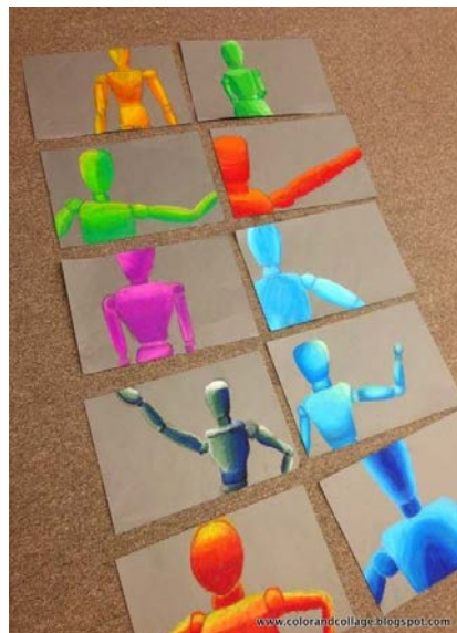
Consider where the picture sits on the page