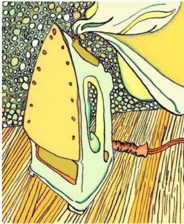
Find an everyday object and create a stylised drawing

This refers to the lightness or darkness of something. This could be a shade or how dark or light a colour appears. Tones are created by the way light falls on a 3D object. The parts of the object on which the light is strongest are called highlights and the darker areas are called shadows.